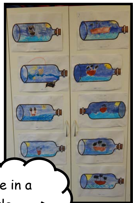
Message in a bottle