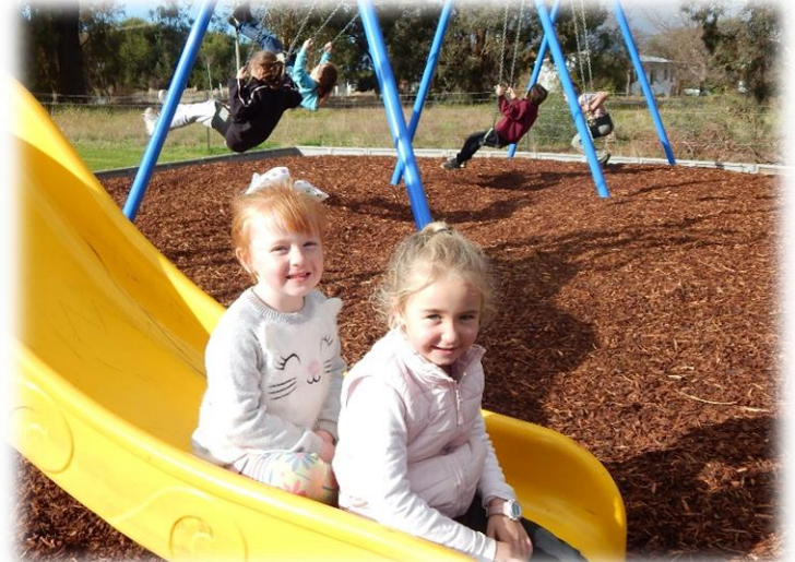
Fun play time in the new Wamoon Park